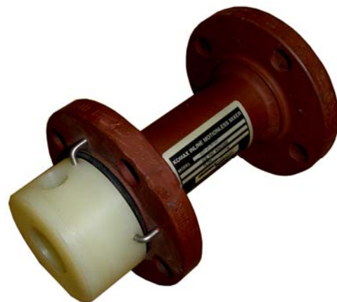
(shown) Teflon Lined Static Mixer with Additive Injection Disk

This in-line static mixer saves energy costs, maintenance labor, reduces space requirements, and has achieved consistent control over the neutralization process.